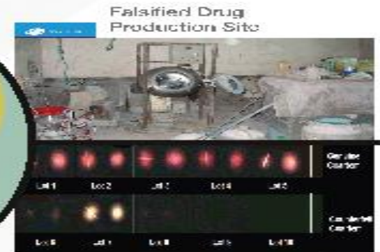
Laser Beam Analysis Genuine and Counterfeit Coartem™