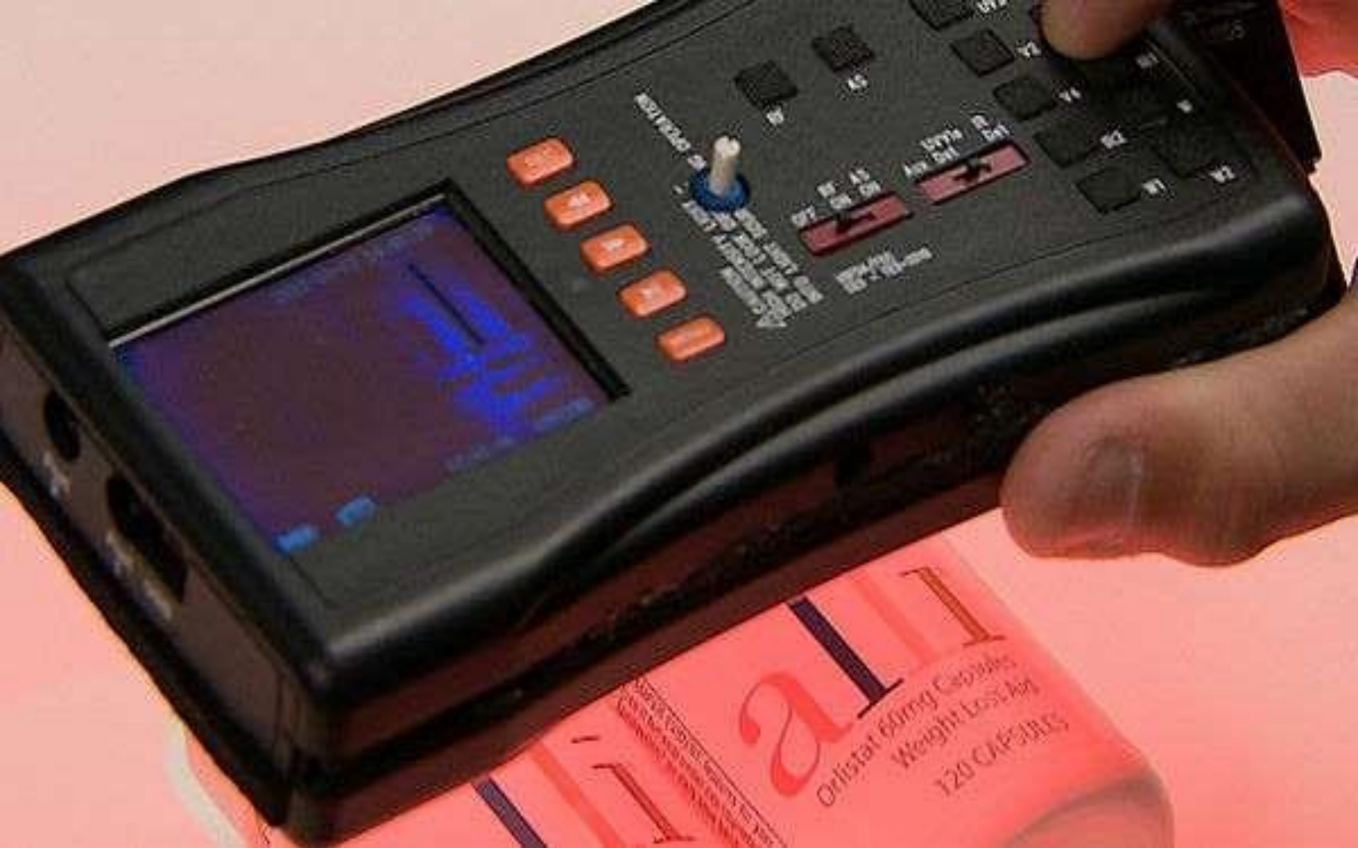
US Food and Drug Administration A handheld CD-3 (Counterfeit Drug Detector Device) scans bottles of Alli, a weight loss drug.